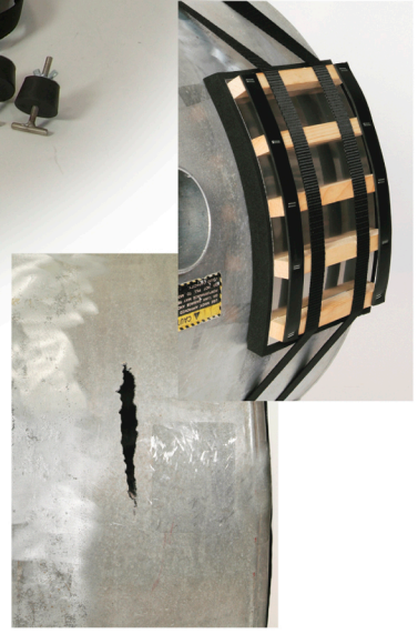
New Ladder Patch with 3/4" foam backing instead of 1/4" hard rubber