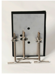
New large Twin T Patch with Offset T-bolts

This new universal leak control kit has components to repair punctures, cracks, gashes or surface rotting of all containers, just as our universal kits you may already have. Additionally, this new kit will allow you to patch some holes that previously were more difficult, such as cracks close to the edge of tanks or supports, and cracks that toggle wings will not fit into. All necessary tools and hardware are included.