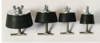
New Taper Surface Plugs with Offset T-bolts