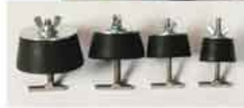
New Taper Surface Plugs with Offset T-bolts

This new universal leak control kit has components to repair punctures, cracks, gashes or surface rotting of all containers, just as our universal kits you may already have. Additionally, this new kit will allow you to patch some holes that previously were more difficult, such as cracks close to the edge of tanks or supports, and cracks that toggle wings will not fit into. All necessary tools and hardware are included.