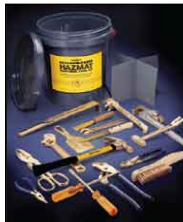
HAZ-MAT Bucket "B-1"