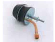
Also Available Separately: 5" "C-1" Plug, 6", 8" and 10" Pipe Plugs

No Complicated procedures are required and no additional tools are needed to utilize these pipe plugs. Because most hazardous material leaks create a potentially life-threatening or property-threatening situation, no emergency response vehicle is fully equipped without Kit "C-1". Also, by containing a problem before it gets out of hand, your staff can save valuable man-hours that might otherwise be spent in full-scale evacuation of an area.