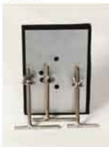
New large Twin T Patch with Offset T-bolts