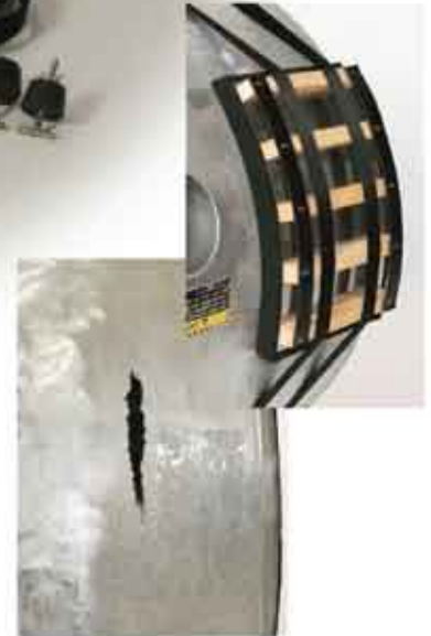
New Ladder Patch with 3/4" foam backing instead of 1/4" hard rubber