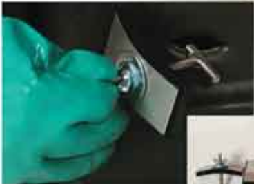
New Offset T Patches for holes & cracks near edge of tank