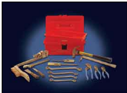
Non-Sparking Tool Kit "G"