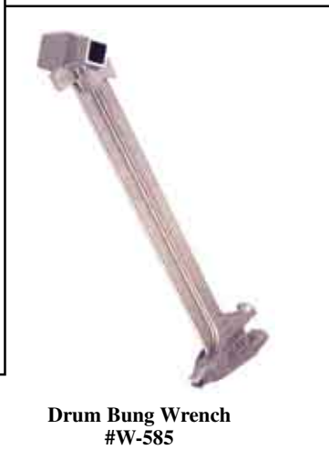
Drum Bung Wrench #W-585