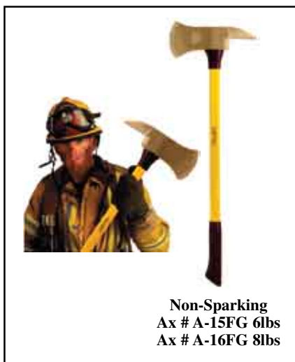
Non-Sparking Ax # A-15FG 6lbs Ax # A-16FG 8lbs